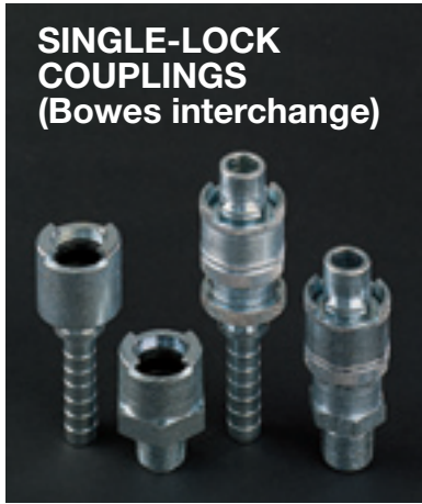
SINGLE-LOCK COUPLINGS (Bowes interchange)